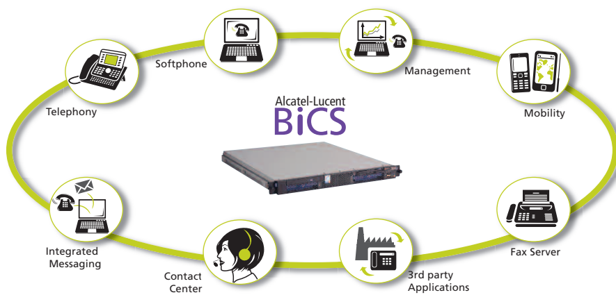
Figure 2. Alcatel-Lucent BiCS: Delivering comprehensive communications on a single server